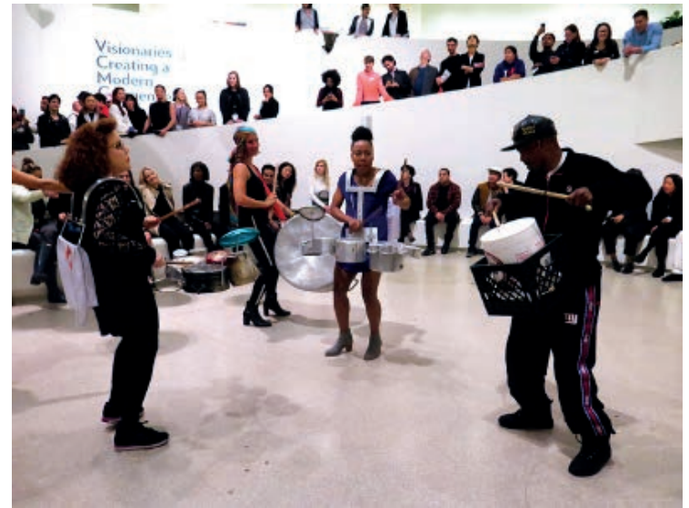
BATUQUE NA COZINHA, 2017, Intervention, Solomon R. Guggenheim Museum, NYC, USA