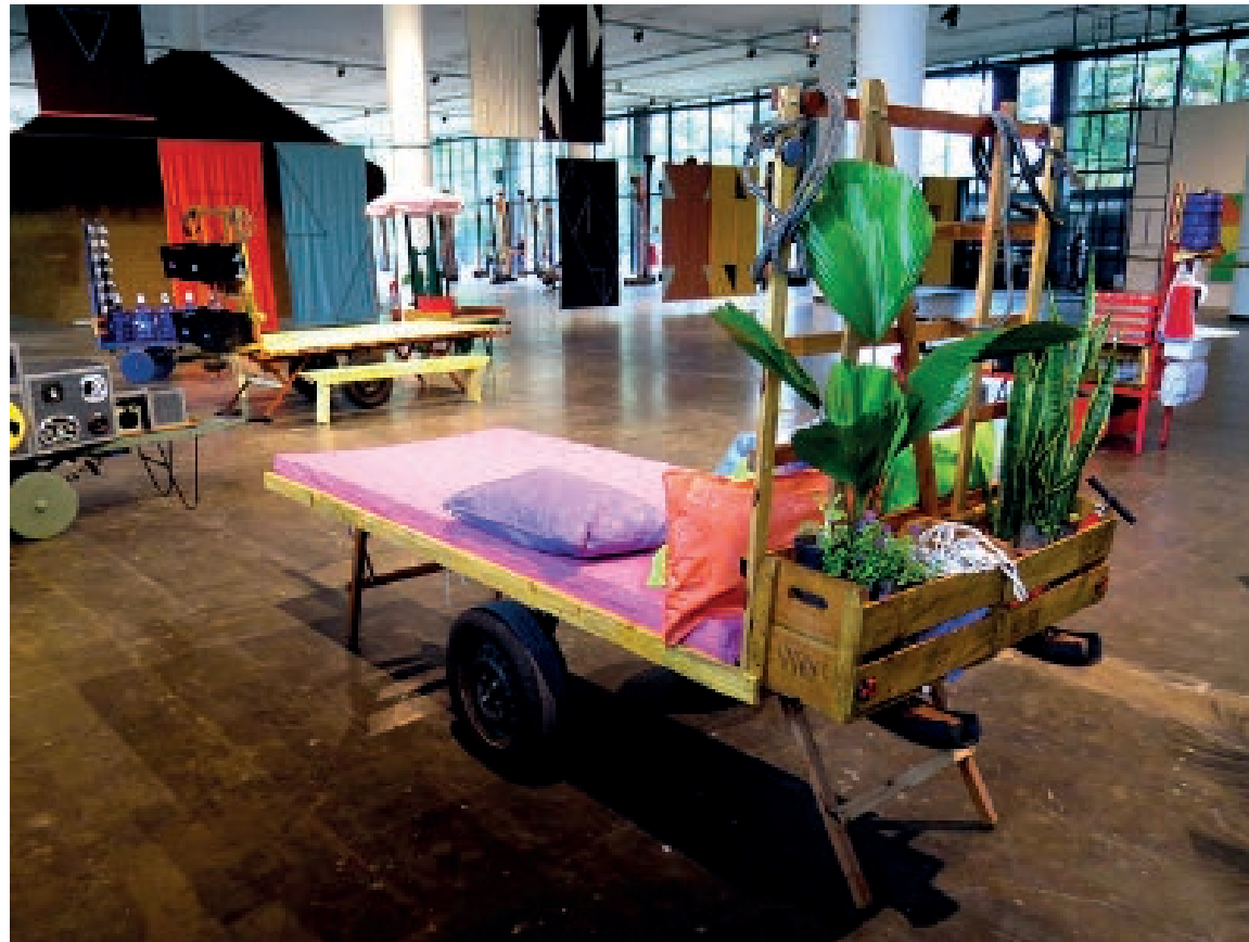
TRANSNÔMADES, 2016, Intervention, 32. Biennial São Paulo, Brazil