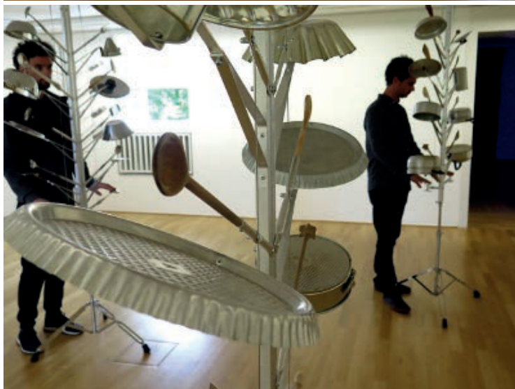
FLORA TREME, Duett mit Künstler -Teilnahme als künstlerisches Prinzip , 2017, Museum Morsbroich, Leverkusen, Installationviews

„The exhibition situation, by demanding social action, creates a space that opens up the institution of the museum because it creates opportunities for encounters. To think of art as an essential part of life, in which „all“ can participate, is not only fundamental to the understanding of art in the 20th century, but is also one of the fundamental democratic values of our society.“