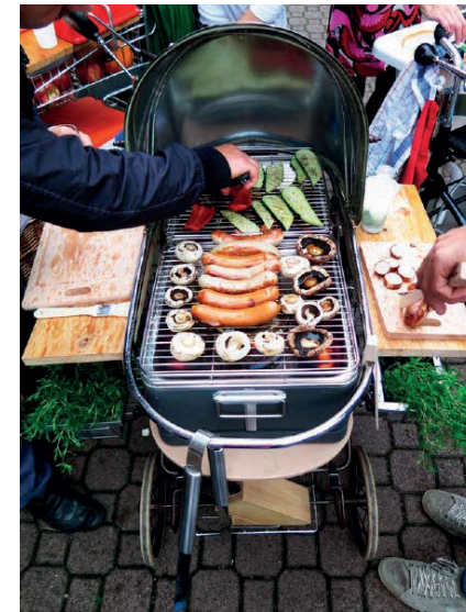
OPAVIVARÁ, TRANSNÔMADES, 2016, Intervention, 32. Biennial São Paulo, Brazil