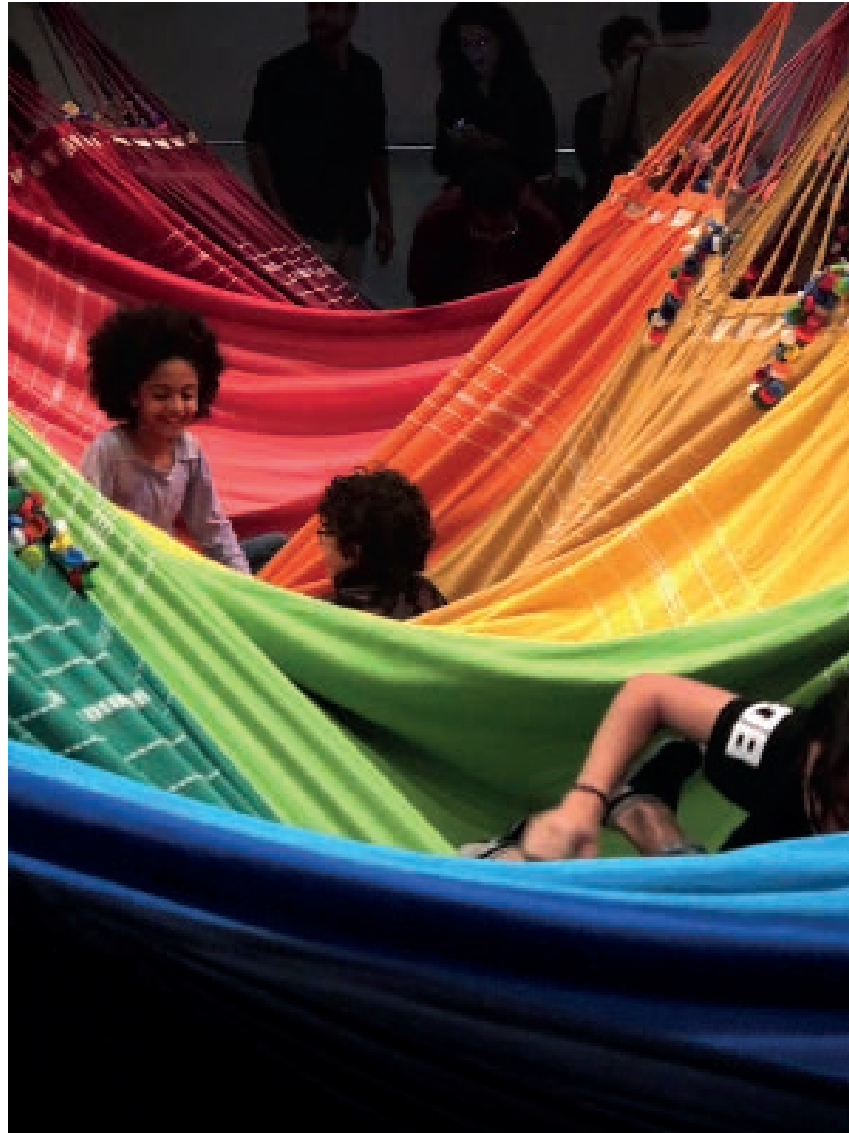
UTUPYA, Rede Social , 2018, Installationview, Tate Liverpool, UK