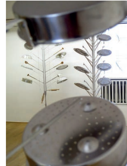
Flora Treme, 2017, group show, Duett mit Künstler -Teilnahme als künstlerisches Prinzip

„The exhibition situation, by demanding social action, creates a space that opens up the institution of the museum because it creates opportunities for encounters. To think of art as an essential part of life, in which „all“ can participate, is not only fundamental to the understanding of art in the 20th century, but is also one of the fundamental democratic values of our society.“