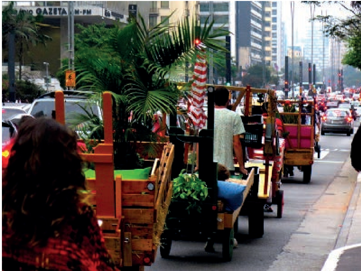
TRANSNÔMADES, 2016, Intervention, 32. Biennial São Paulo, Brazil