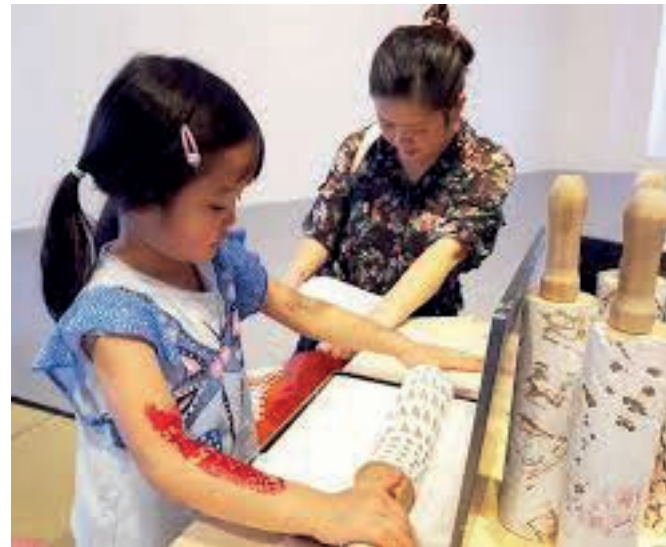
UTUPYA, Rede Social, Self Service, Animal Skin 2018, Installationview, Tate Liverpool, UK